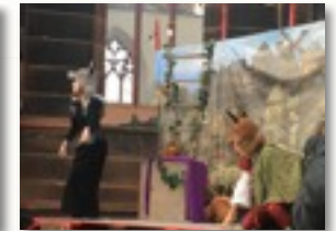
The site offers an atmospheric backdrops for dramatic productions and events.