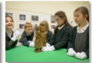
Schools are able to handle pieces from the collections with the learning officer.