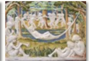
The largest public collection of Della Robbia pottery from Birkenhead in the UK