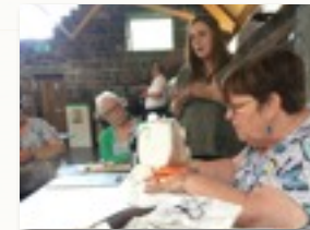
From 2015 & 2016, embroidery workshops in the refectory for adults.

The Wirral Museums Service are fortunate to have a dedicated art room, a learning officer and an artist in residence offering arts education through schools and colleges, and with support from FRIENDS and national grants also offer regular free drop in family workshops. There are also frequent workshops with individual artisans.