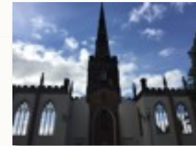
Saint Mary's tower and commemorative steps to H.M.S. Thetis link to Wirral's past.

The oldest standing building on Merseyside offers a unique insight into the town of Birkenhead and its historical and spiritual importance in the development of Wirral, with St Mary's Tower and the Conway Chapel.